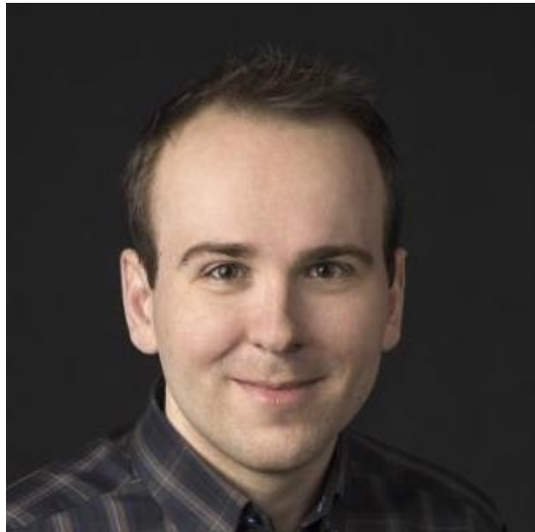
Pawel Foremski bgpipe – open source BGP reverse proxy