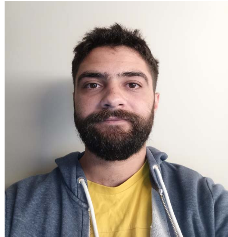
Savvas Kastanaki 20 Years of Inferring Inter- domain Routing Policies