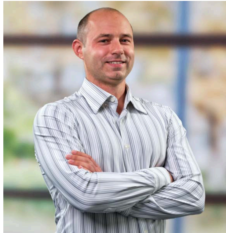
Yury Zhauniarovich Peering into the Darkness – The Use of UTRS in Combating DDoS Attacks