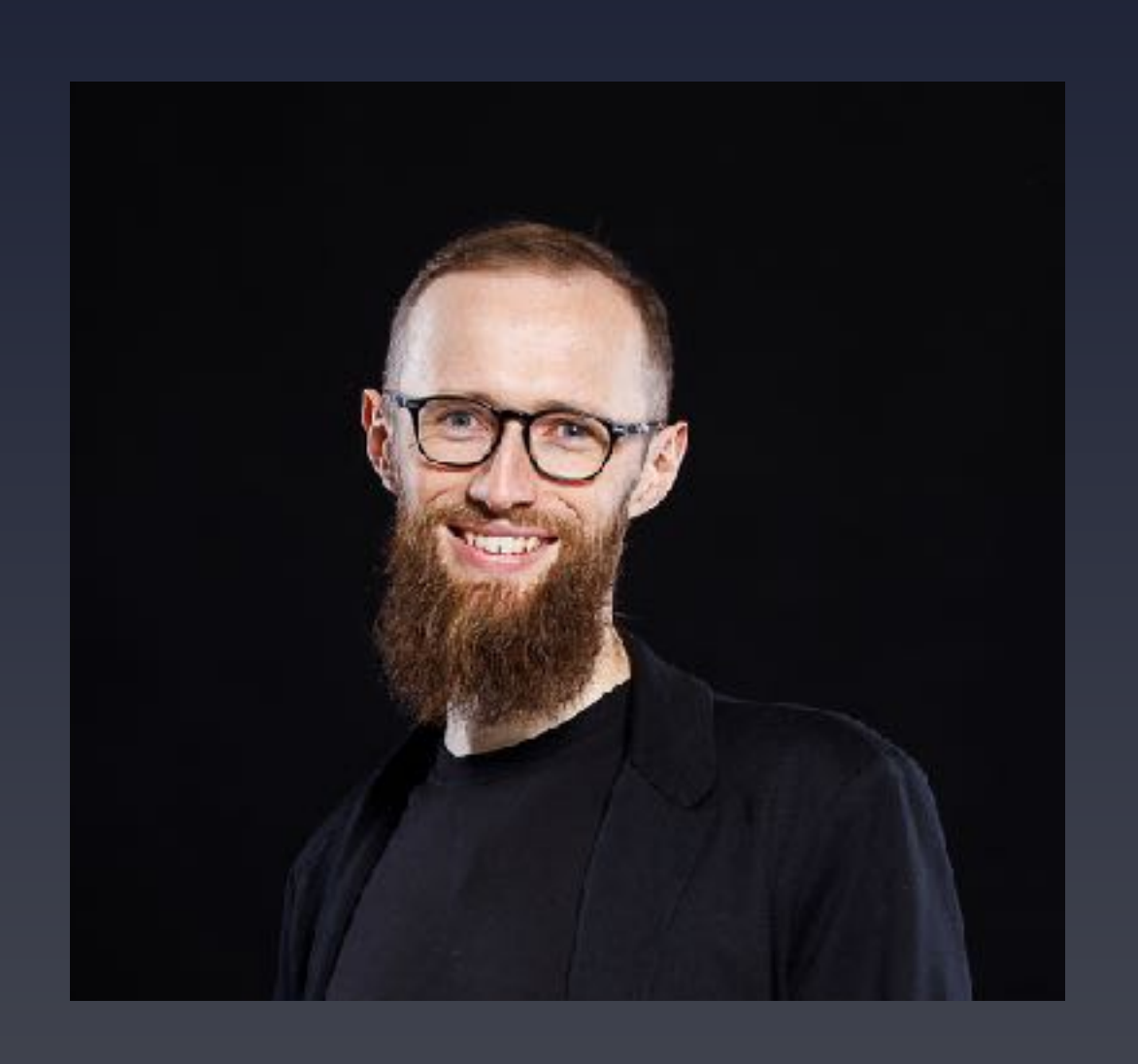
Piotrek Kordyś Official RIPE 88 Photographer